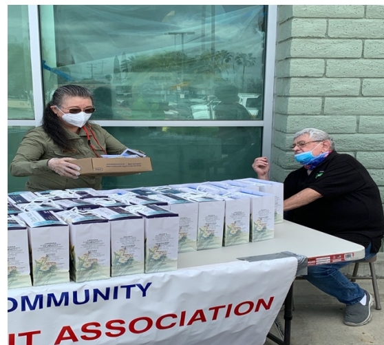
PPE Giveaway at Hsi Lai Center