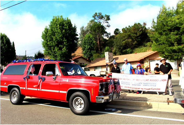
July 4th Parade